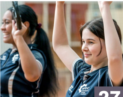
27 Certificate III in SPORT, AQUATICS & RECREATION