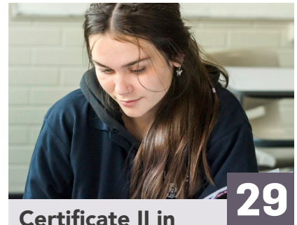
29 Certificate II in WORKPLACE SKILLS/ Certificate III in BUSINESS