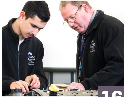
16 Certificate II in AUTO VOCATIONAL PREPARATION