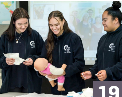
19 Certificate III in EARLY CHILDHOOD EDUCATION & CARE