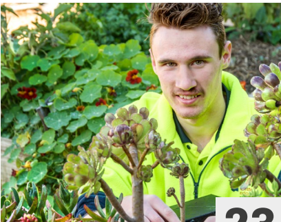
23 Certificate II in HORTICULTURE