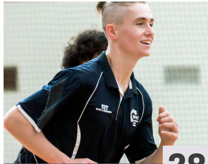
28 Certificate III in SPORT - SOCCER