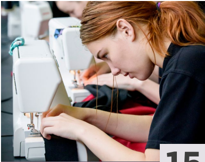
15 Certificate II in APPAREL, FASHION & TEXTILES