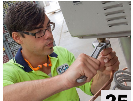
25 Certificate II in PLUMBING