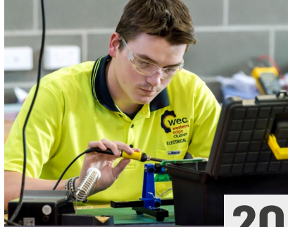
20 Certificate II in ELECTROTECHNOLOGY (PRE-VOCATIONAL)