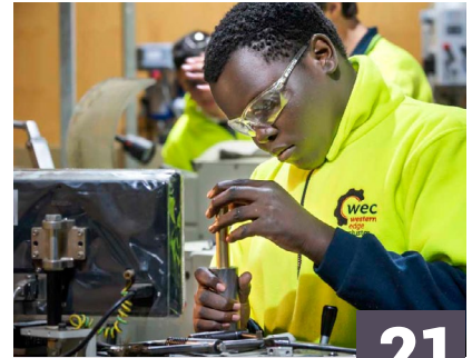
21 Certificate II in ENGINEERING STUDIES