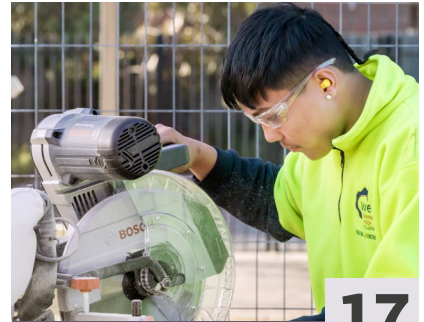
17 Certificate II in BUILDING & CONSTRUCTION