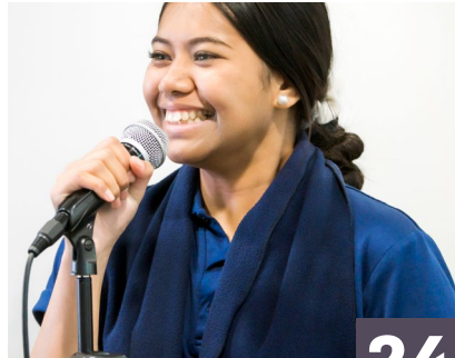
24 Certificate III in MUSIC PERFORMANCE